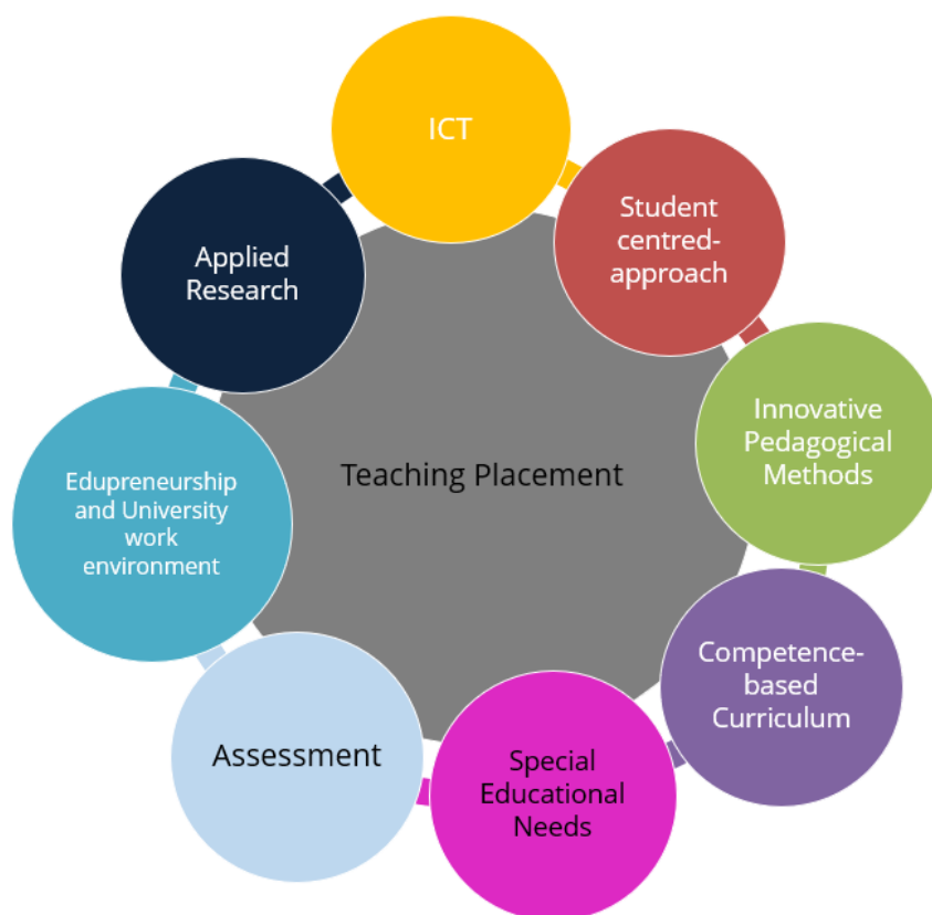
Figure 4: 9-Module Pedagogical Training Programme