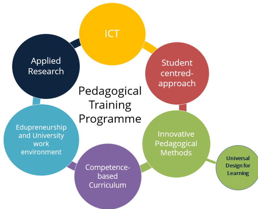
Figure 2: Modules in the Pedagogical Training Programme including UDL to cater for SEN