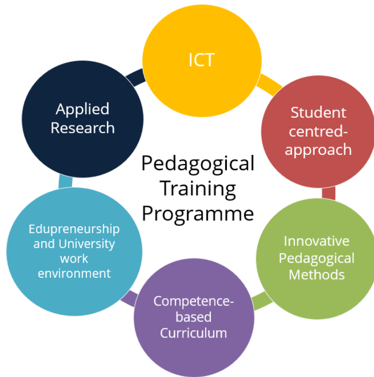
Figure 1: Current Modules in the Pedagogical Training Programme